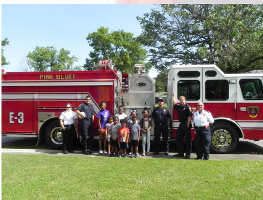
Fun Day at New Faith Missionary Baptist Church !