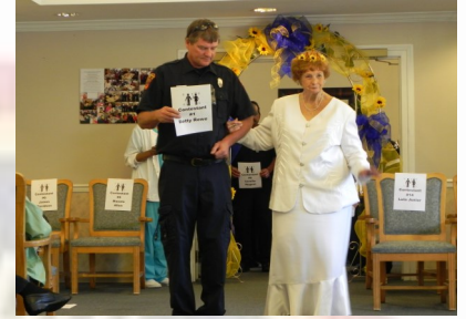
Davis Life Care King & Queen Pageant