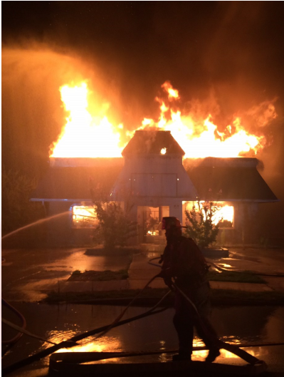
July 20th 1019 N University Drive